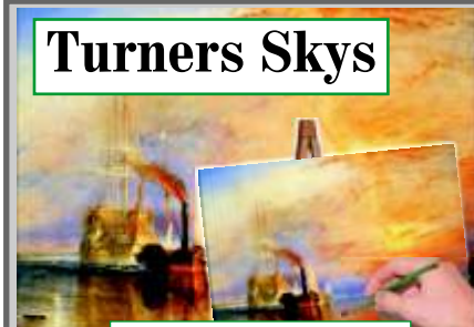
The Fighting Temeraire